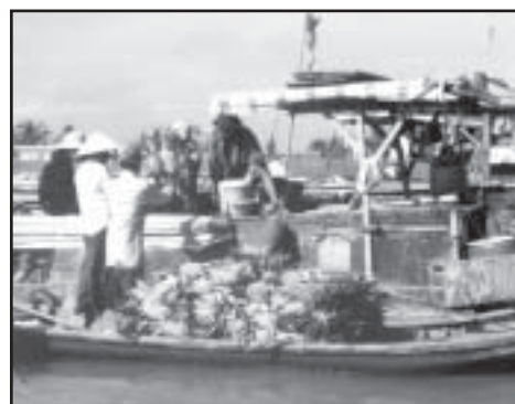
View of floating market in Cantho, Vietnam marketing pineapples.

CRSP; International Sorghum and Millet (INTSORMIL) CRSP; Peanut CRSP; and Sustainable Agriculture and Natural Resource Management (SANREM) CRSP. Multiple faculty and staff from nine departments in two Schools (Agriculture; Consumer and Family Sciences) are affiliated with one or more of the CRSPs. CRSP highlights for the 2003-2004 period are described below.