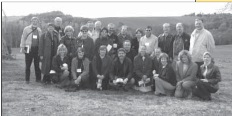
Participants in the Purdue-led farmer exchange program (AGRIDAYS) in France.