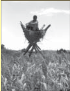
Young boy employed to scare birds from a sorghum field in Ethiopia.

Peanut CRSP: Under the leadership of Rick Mattes, Foods & Nutrition, three clinical interventions have documented that peanut consumption significantly improves lipid profiles and aids in weight loss/weight maintenance. Another international, multi-center clinical trial with collaborators in Brazil and Ghana is being conducted exploring the effects of chronic peanut oil consumption on appetite and food choice.