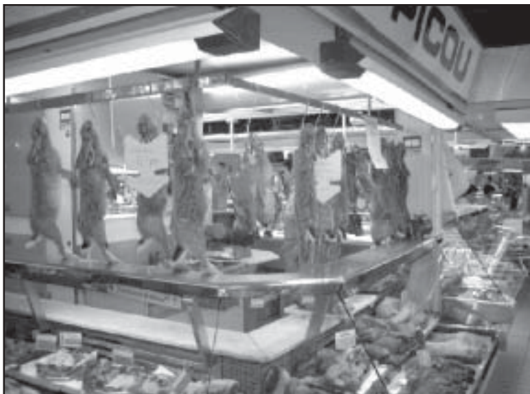
A meat market in Toulouse, France which was visited during the AGRIDAYS program.

International Association of Students in Agricultural and Related Sciences (IAAS), in March 2004. His visit served as a catalyst to organize a chapter of the organization on the Purdue campus, something that we hope to do soon. The organization seeks to foster international understanding among students with interests in agricultural and related sciences through discussions, global meetings, and professional development activities.