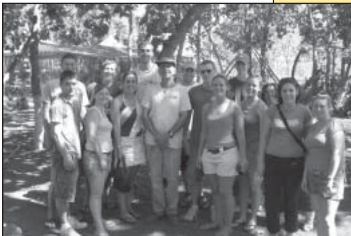
Purdue students in Cuba who participated in a new study abroad program.

Host Family Participation: A total of 10 Indiana families hosted international exchange students from Japan and Ireland. Host fami-